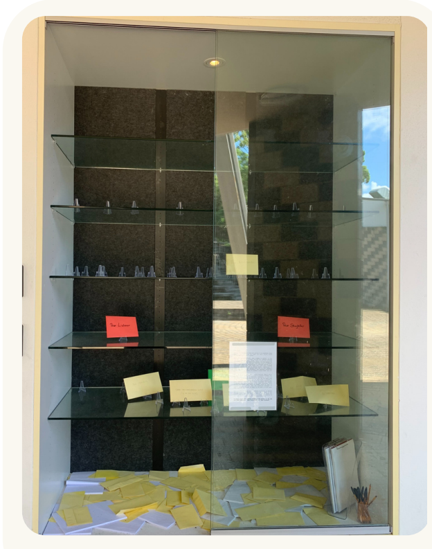
DISPLAY CABINET #1

The display cabinets that artists will have access to via Backbone's On Display Program are located at the Seven Hills Hub. There are two identical cabinets that measure 2.18m high, 1.54m wide and 0.72m deep . Each cabinet has 5 glass shelves that can be adjusted in height or completely removed. They can be accessed via lockable sliding glass doors that have an opening of 0.72m wide . The cabinets do not have access to power , but have one downlight each.